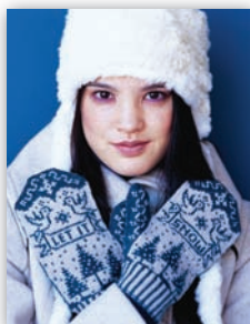
SNOWBIRD MITTENS PAGE 10