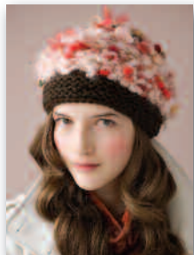
ROMANTIC PAGE 71