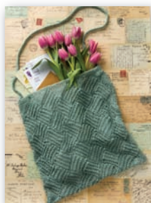
MARKET TOTE PAGE 90