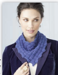
QUICK KNIT KERCHIEF PAGE 113