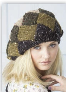
TWEED BERET PAGE 112