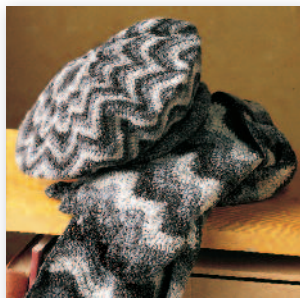
Scarf and beret, page 84

With its wide range of classic pattern stitches and projects for every skill level, Crochet! shows this traditional craft in an entirely new light.