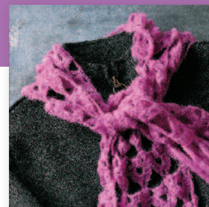
Lacy scarf, page 148

Brimming with techniques, stitch tutorials and inspiration!