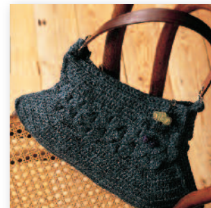
Carrier bag, page 111