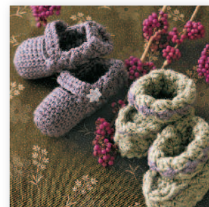
Baby booties, page 74