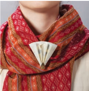
DELICATE MAIDENHAIR LEAF BROOCH P.115