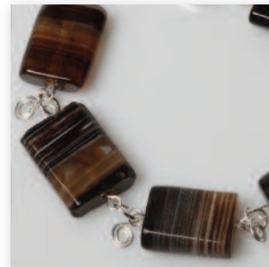
Spiral Bracelet, page 93