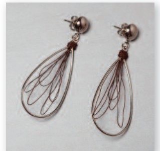
Dragonfly Earrings, page 115