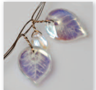
Leafy Necklace, page 45