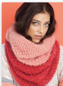
MOHAIR IS BETTER PAGE 28