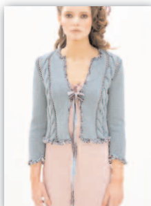
CECILE RIBBON EDGED CARDIGAN PAGE 119