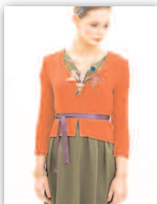
SYLPH V-NECK CARDIGAN PAGE 31