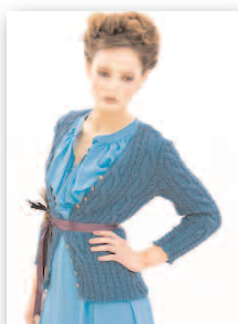
KITTY CABLE AND EYELET CARDIGAN PAGE 109