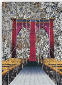
KALEIDOSCOPIC XXXII: MY BROOKLYN BRIDGE PAULA NADELSTERN PAGE 131