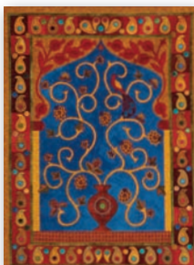
WOKEFIELD PARK SHULAMIT RON PAGE 113