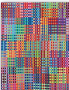
A COMPLETE BASKET CASE KENT WILLIAMS PAGE 76